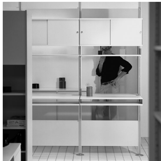
Dieter Rams, Frankfurt, 1971