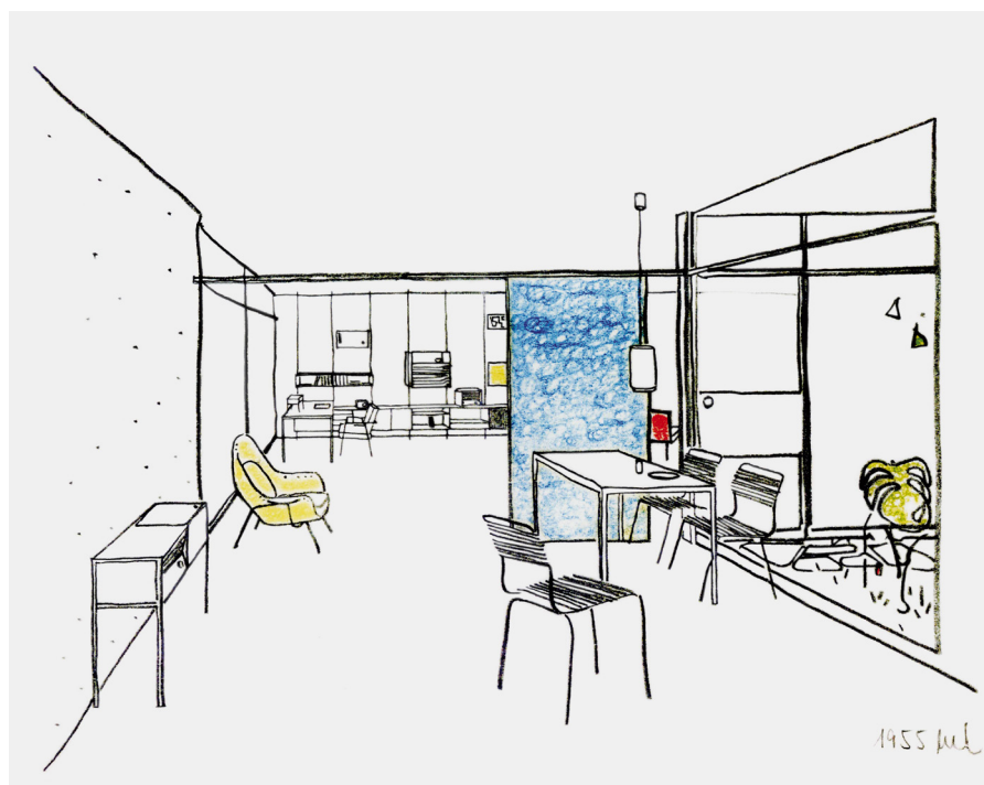
Dieter Rams's first sketch including a shelving system, 1955.